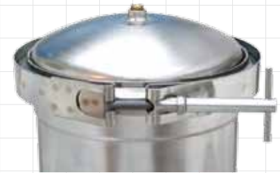
Band Clamp Assembly