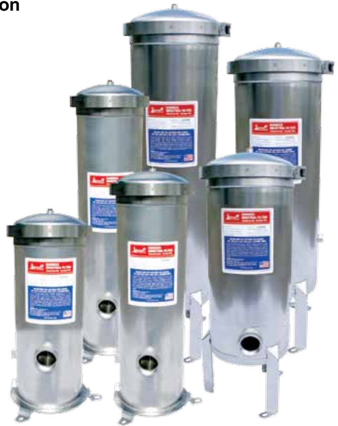
Models BC4-1, BC4-2, BC4-3, BC6-1, BC6-2, BC6-3

316 stainless steel Sanitary, BSTP or victaulic connections